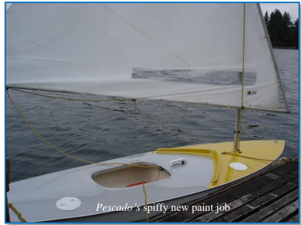
Pescado's spiffy new paint job