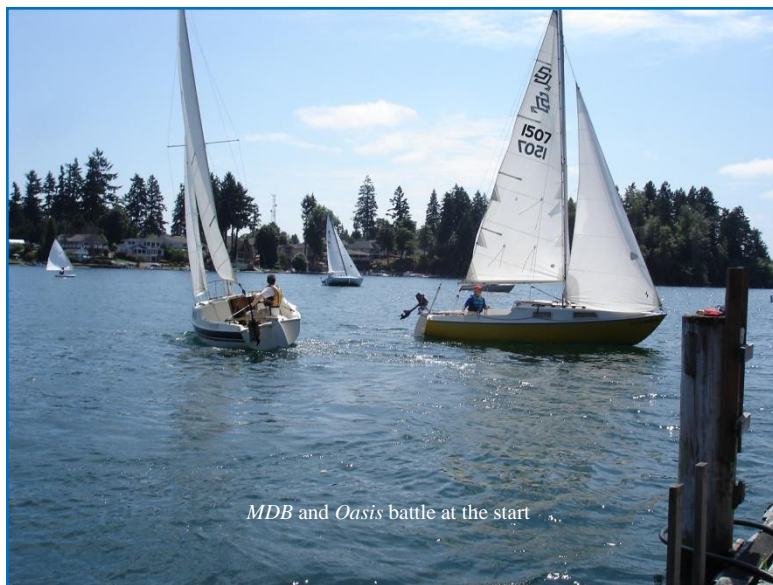
MDB and Oasis battle at the start