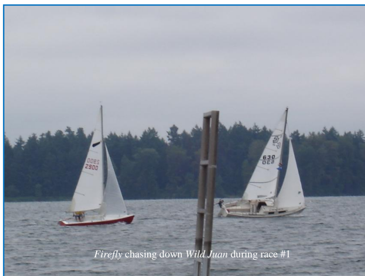
Firefly chasing down Wild Juan during race #1