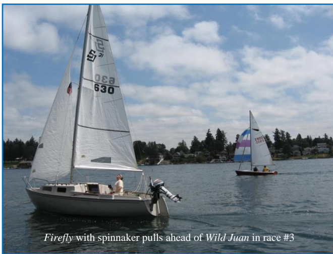
Firefly with spinnaker pulls ahead of Wild Juan in race #3