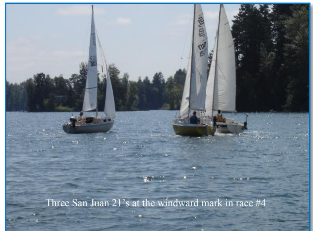
Three San Juan 21's at the windward mark in race #4