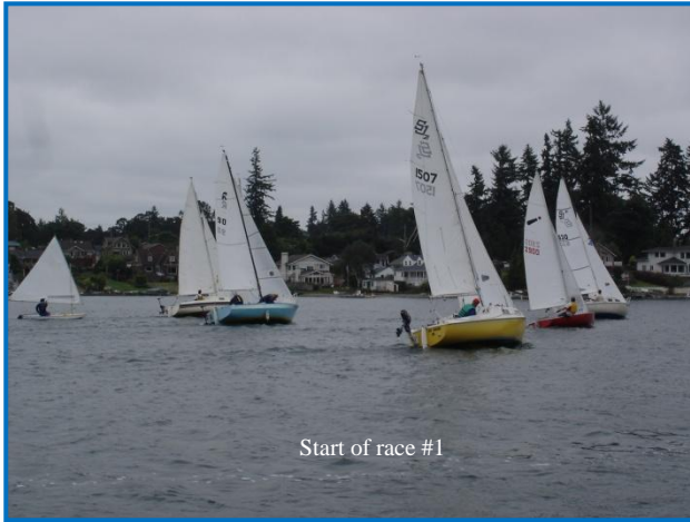
Start of race #1