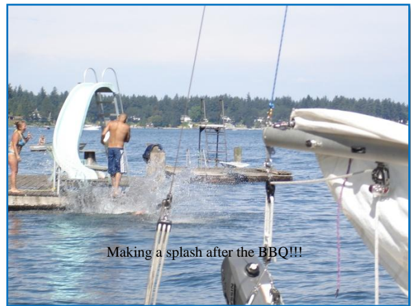
Making a splash after the BBQ!!!