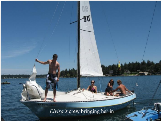
Elvira's crew bringing her in