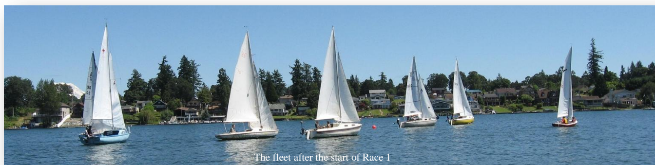
The fleet after the start of Race 1