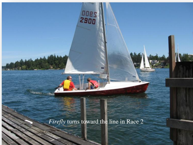
Firefly turns toward the line in Race 2

In the second race, I wanted to use the same starting strategy as the first race. However as we came in to the dock with about 2 minutes to the start we hit one of these dreaded dead spots and by the time we got Firefly going again it was just 10 seconds before the start. By sheer luck Firefly got an excellent start! We were on the starboard tack, windward of the rest of the fleet and a full speed when the horn blew and we crossed the line. After a couple of tacks we hit the lay line to the first mark and easily made to mark in first place. Learning from the first race we decided not to set the spinnaker on the downwind leg of this race. At one point during the downwind leg we hit a dead spot and were starting to get worried as Wild Juan and Oasis were closing the gap fast. Rounding the leeward mark first Firefly held off Wild Juan taking the win.