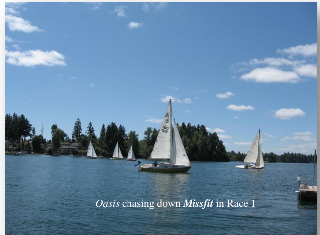
Oasis chasing down Missfit in Race 1

After the top three boats finished something funky happened to the wind. It couldn't decide which way to blow... coming from all directions. The first three boats finished in around 35 minutes; however the rest of the fleet struggled in the weird winds finishing with times all over the 1 hour mark. Go figure.