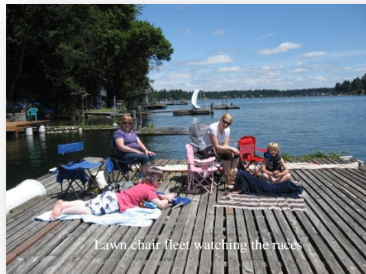
Lawn chair fleet watching the races