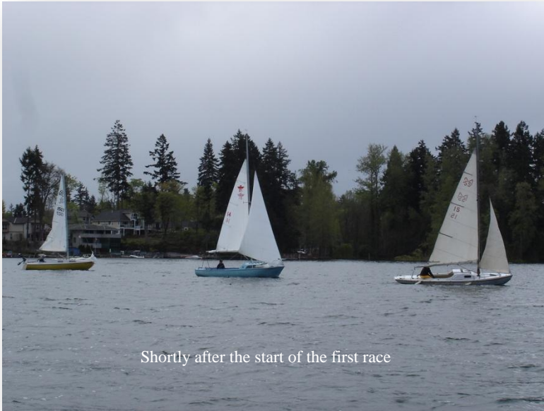
Shortly after the start of the first race

As it turned out the wind was blowing over 15mph with gusts to 20mph. So... I reefed my main as did Rodney in Missfit and the two keel boats used only one sail. Our sole dinghy with Layne and James on Firefly used main and jib and actually did a good job