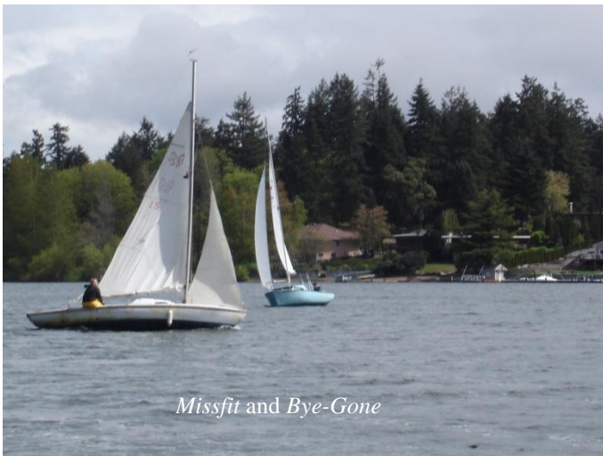
Missfit and Bye-Gone