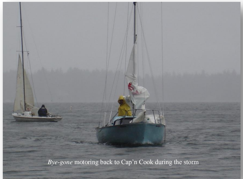
Bye-gone motoring back to Cap'n Cook during the storm

(1st overall) and dodged the huge rain and its wind blast at the end of race #2 by finishing just ahead of that big black cloud and all it had in store for us. Our races course were the same for #'s 1 and 2. (Head South and around Silcox Island.) Since there was so much wind I figured we'd have no trouble with the lee of the island. That proved to be the case. While the wind built and chop developed we all had some very fast moments as well as dicey ones. And as I said near the end of the 2nd race that black cloud bore down on us and boom it hit. Everyone managed to finish (Except Bye-Gone ) and got a good dose of rain to boot. I still had too much sail for sailing single handed and bore away to the North eventually dousing both sails and motoring back to the Cap'n Cook. By then the white caps were breaking up on the crests and water was splashing over the bow and back into the cockpit (and on me). So... we all had that adrenaline rush we crave and eventually all got back to enjoy snacks and especially Layne's Rhubarb/Strawberry pie. Lessons learned: Same-o-Same-o. If you're not on the lake you miss a good time. And... having crew is a must under more windy conditions... And wear those life jackets. (We all did.)