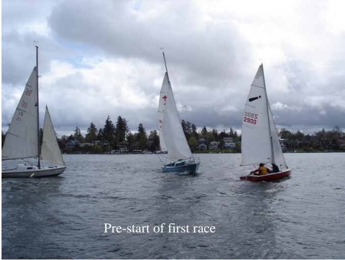
Pre-start of first race