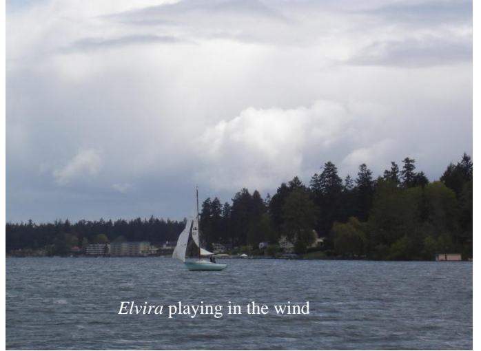
Elvira playing in the wind