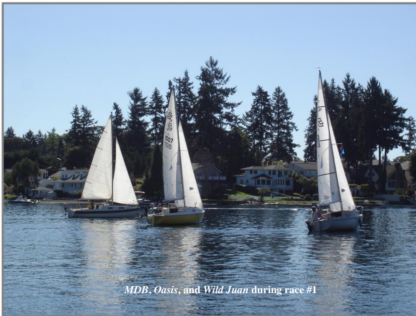
MDB, Oasis, and Wild Juan during race #1