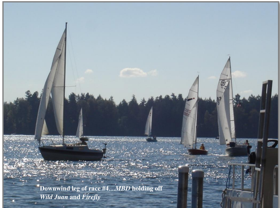
Downwind leg of race #4... MDB holding off Wild Juan and Firefly