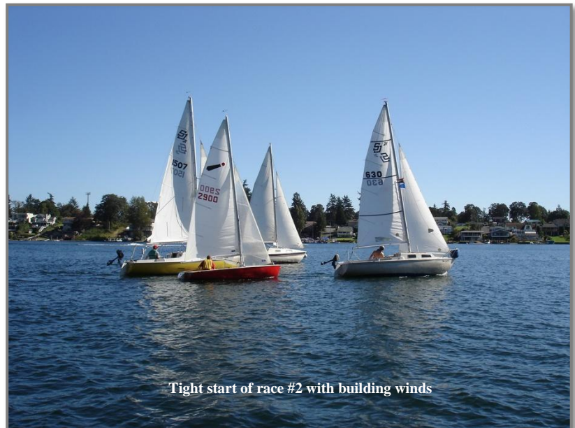
Tight start of race #2 with building winds

The second race was very exciting. I think that there were 5 lead changes during the race. The winds were so light before the start; Frank decided to shorten the course to the triangle one between Silcox Island and Bill's Boathouse. Shortly before the five minute horn went off there were some weird microburst downdrafts that hit the lake suddenly and caught all of us off guard. I thought for sure that I was going over. I had one rail deeply buried in the water before easing the main and turning windward. Gena, watching from the dock thought that I was going over too. She said the mainsail hit the water. There were a couple of those big gusts of winds came through that made me wished that I had crew for help with sheets and ballast. Scott in Wild Juan and Andy in MDB and myself in Firefly all got off to good starts which is very important on the short course.