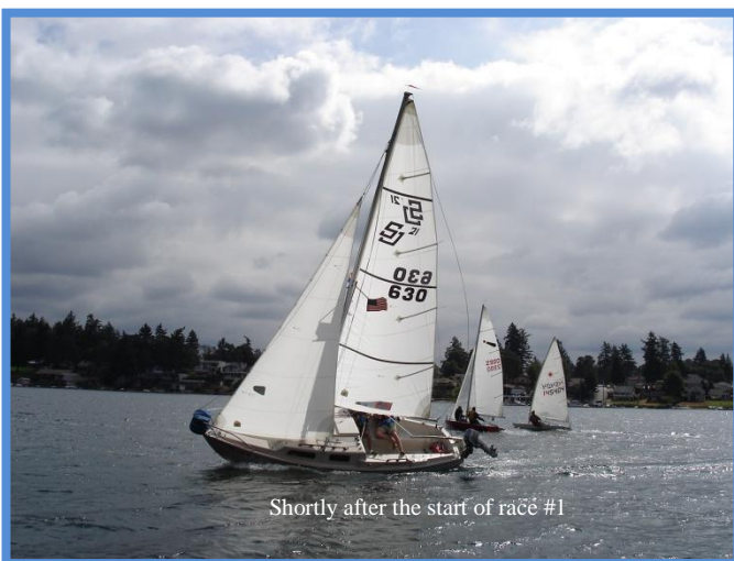
Shortly after the start of race #1