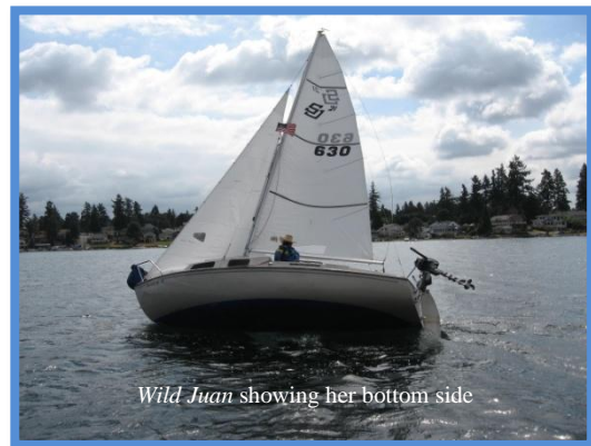
Wild Juan showing her bottom side