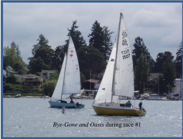
Bye-Gone and Oasis during race #1