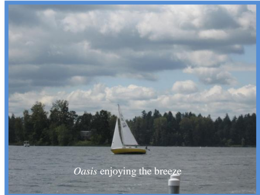
Oasis enjoying the breeze