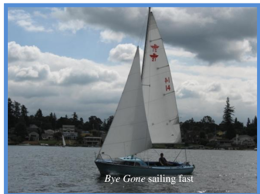
Bye Gone sailing fast