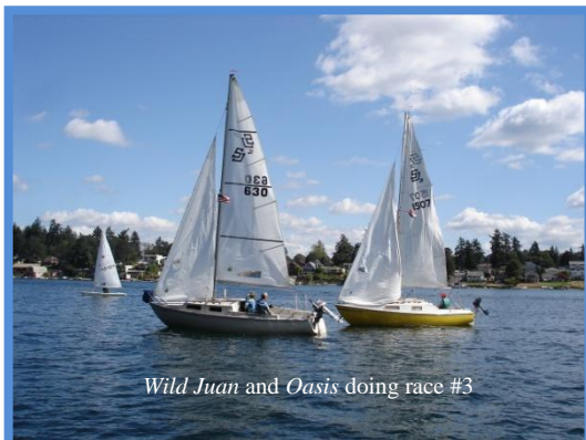
Wild Juan and Oasis doing race #3