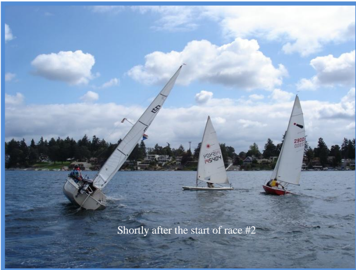
Shortly after the start of race #2